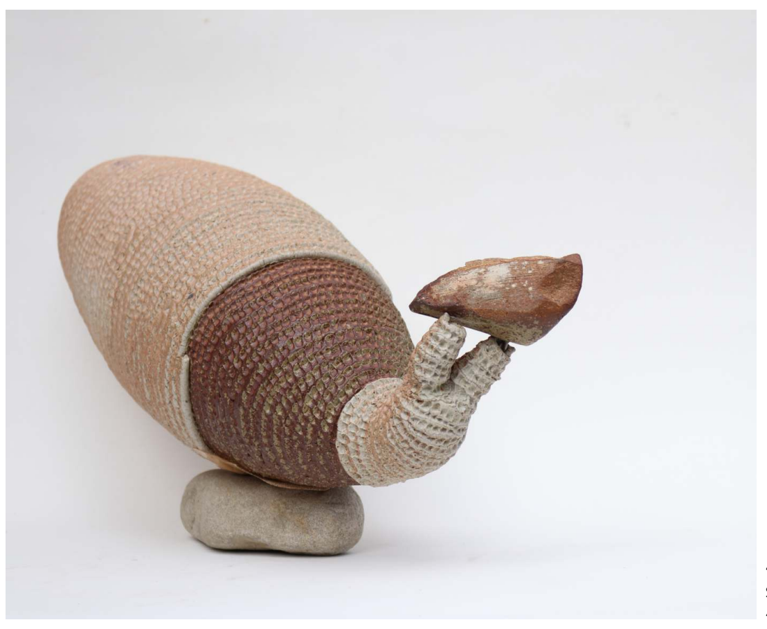
'Fossil II' Stoneware & found stone 45" x 25" x 30"

This series of works came in a succession from the earlier Scabrous Allure series, where I was playing with the interrelations of negative & positives. These are metaphors for the preserved remains of emotions and related observations in one's life. These imaginary forms of non-visual things are visual evidence of pre-existing thoughts which never got expressed previously in any form.