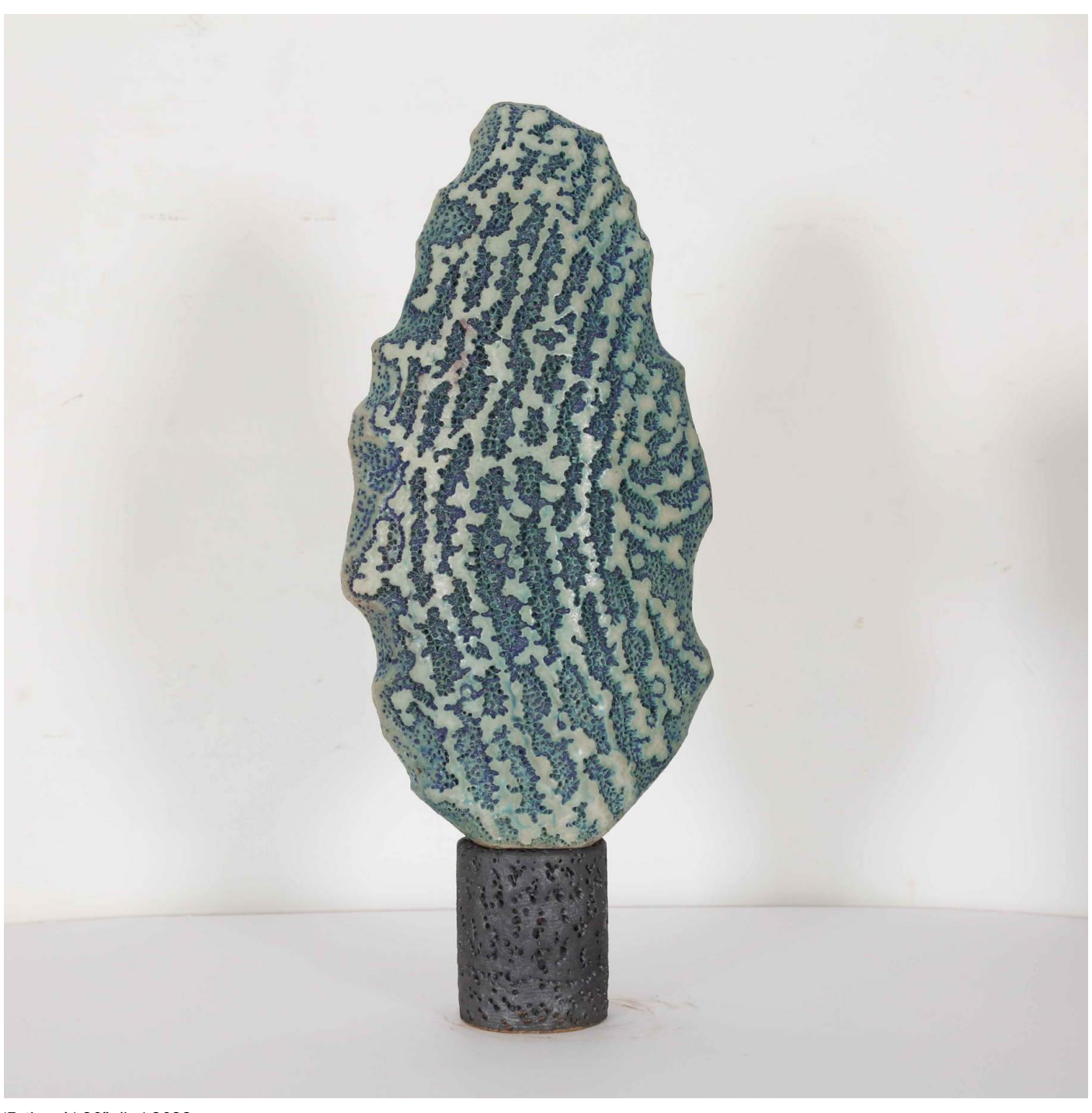
'Fathom' | 20" dia | 2022