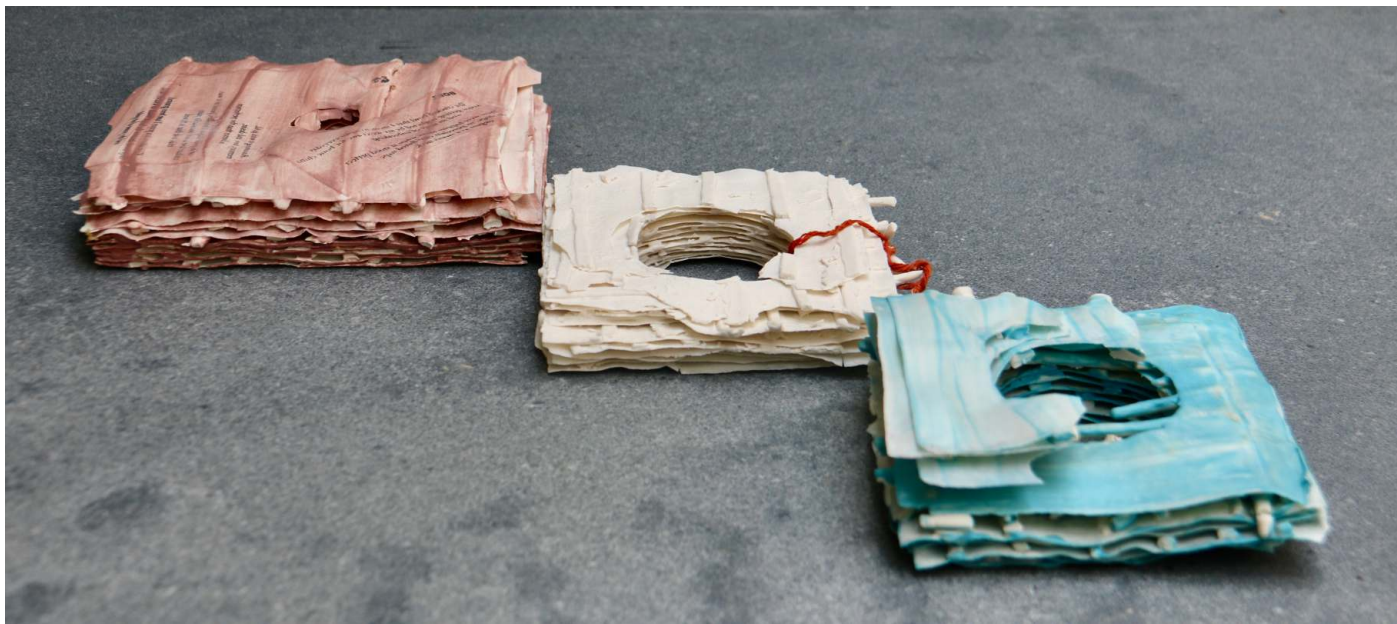
'Memoirs of Transformation Series' Varying Sizes 2016 Porcelain clay with slip and printing