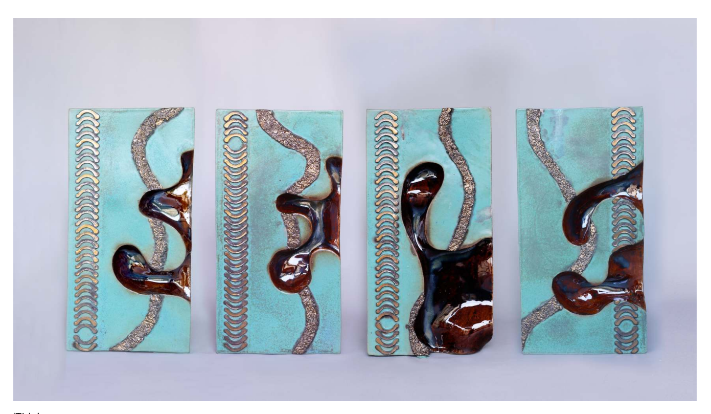
'Tidal 21" x 11" x 3" 2022

I travel with the clay following its rhythm. The path follows a never-ending pursuit of the balance between form and flow. Nature always carves the earth, each and every second. Without rest, it follows a path though seas, rivers and rain creating a flow of earth. The natural elements each in their own right leave a lasting mark in these carvings. Fire - like a volcano with lava flow melting, carving and creating depth; Air - like a cyclone creating with the full force of a storm; Earth - like the earthquakes moving and shaping the Earth; Sky - like clouds and rainbow surrounding the Universe.