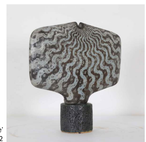
'Troposphere' 20" x 20" | 2022

I have grown up around the coastline of Mumbai and my home is just few km. away from the sea. I have dreamt since childhood about exploring the ocean floor and its unfathomable treasures. In my work, I try to recreate the abstract textures of the ocean floor. The ceramic surface is perfect to depict my visualisation of the earth's atmosphere with a bird's eye view from space. I have frozen those blue, white and grey skies and the atmospheric gases with textured clay and engobes in an abstract language using my clay material.